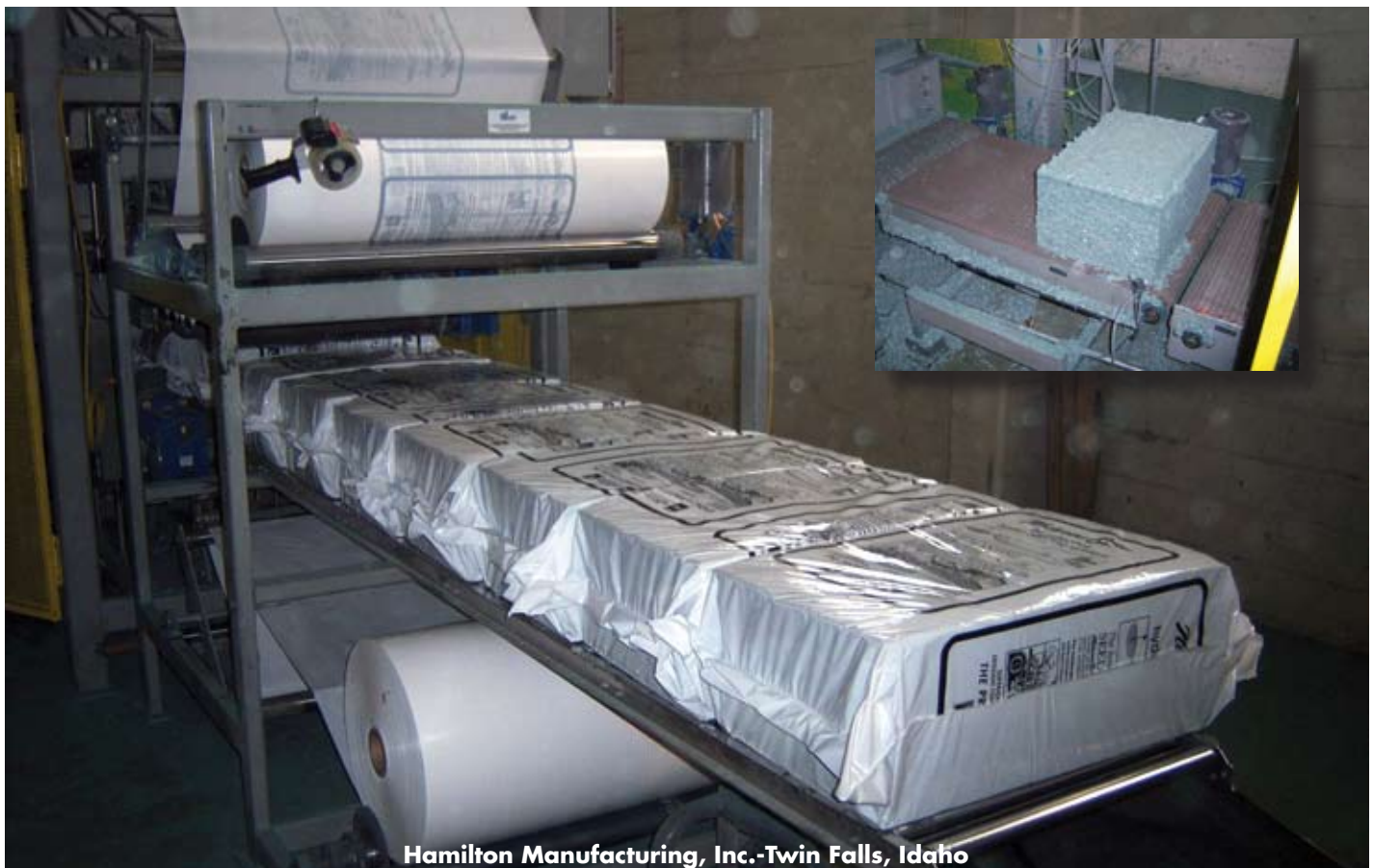
Hamilton Manufacturing, Inc.-Twin Falls, Idaho